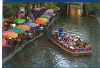
Relax on a cruise at the famous River Walk