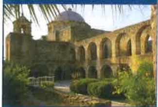
Mission San Jose is one of America's great landmarks