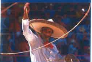
Enjoy the sights and sounds of San Antonio